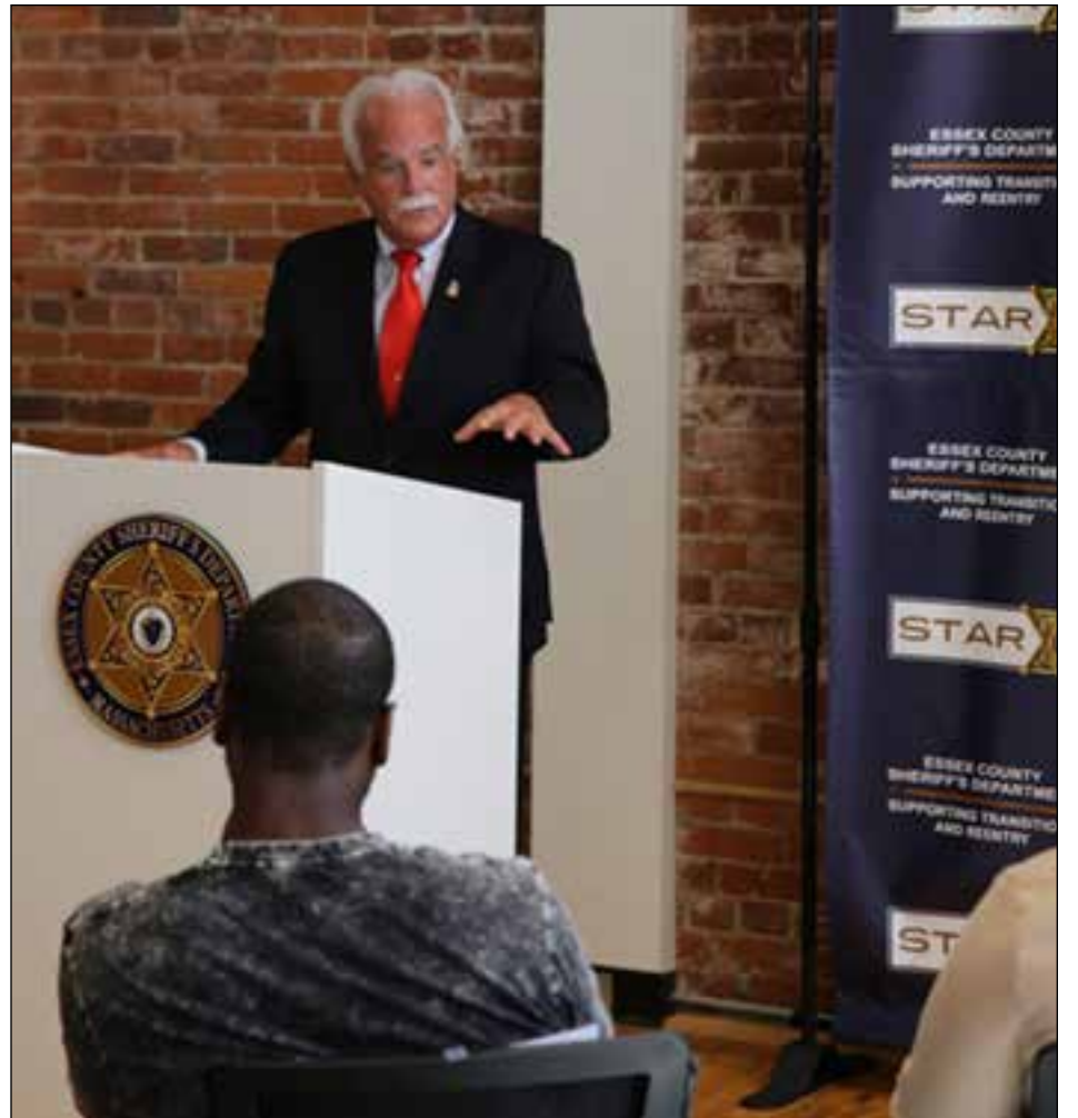
The STAR program, launched in 2022, was designed to help individuals transition successfully back into their communities after incarceration. For Essex County Sheriff Kevin Coppinger, that mission is deeply personal. (Page 4)