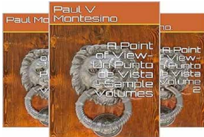
A Point of View-Un Punto de Vista: Volume Seven-Volumen Siete. (A Point of View-Un Punto de Vista Bilingual books) (Spanish Edition) Spanish Edition | Related to: A Point of View-Un Punto de Vista Bilingual books | by Dr. Paul Victor Montesino.