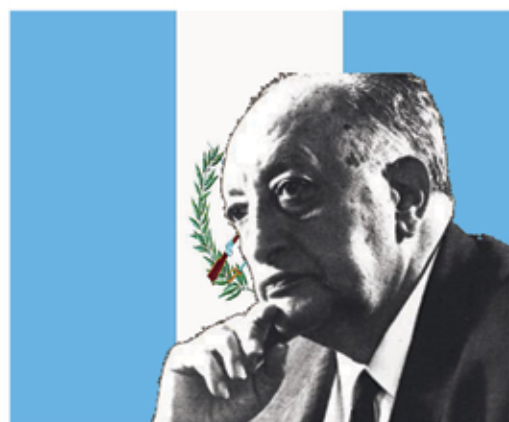
MIGUEL ANGEL ASTURIAS