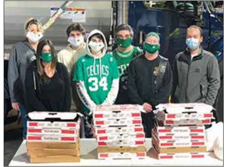
Boston Celtics provided lunch for Lawrence DPW workers on Thursday, April 30. See more pictures on page 15.

Boston Celtics proveyó el almuerzo para los empleados de DPW en Lawrence el pasado jueves, 30 de abril. Vea más fotos en la página 15.