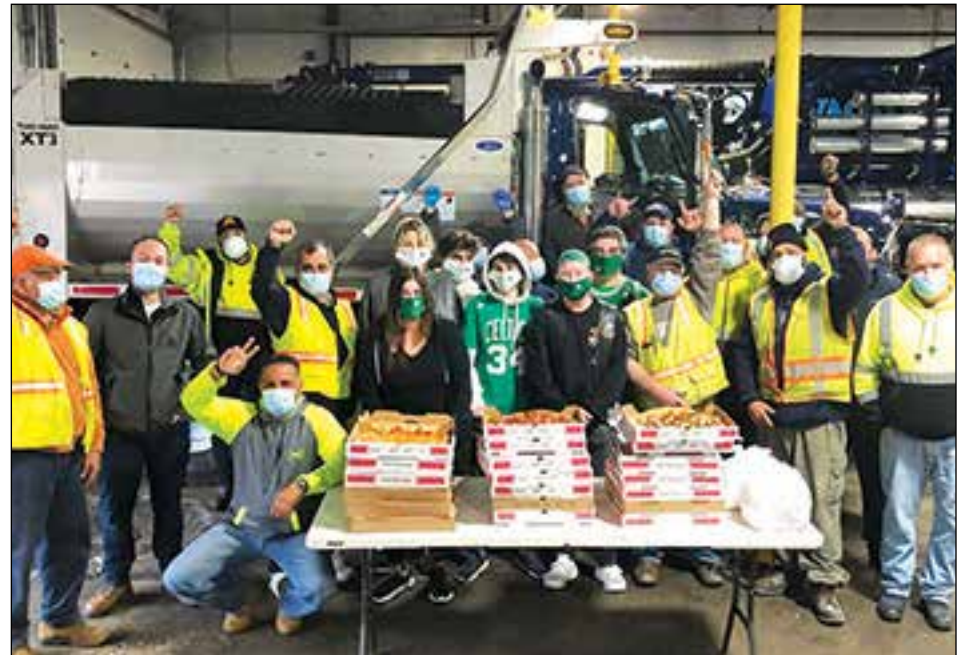
Un grupo de empleados de DPW en Lawrence que recibieron un almuerzo de pizzas cortesía de Boston Celtics en reconocimiento del trabajo que realizan en medio de esta situación.

A group of Lawrence DPW workers who received a pizza lunch courtesy of Boston Celtics in appreciation for the work they do in the midsts of the present situation.