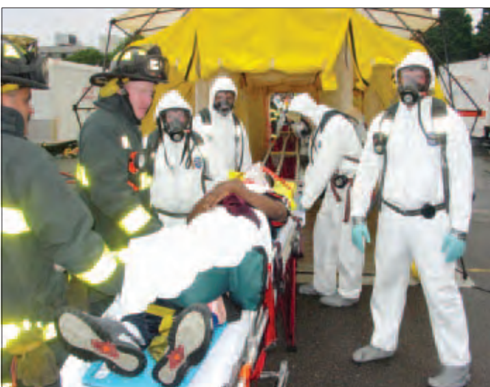
A la izquierda, la carpeta en el L.G.H. donde darán otro tratamiento a las víctimas a base de agua y productos químicos antes de ser admitidos al hospital.

Below, L.G.H. specialized personnel making sure the victims are free of radiation, before admitting them for treatment.