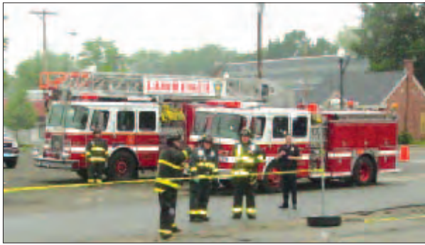
Los bomberos de Lawrence fueron los primeros en llegar.

The victims were represented by members of the Lawrence Citizens Police Academy