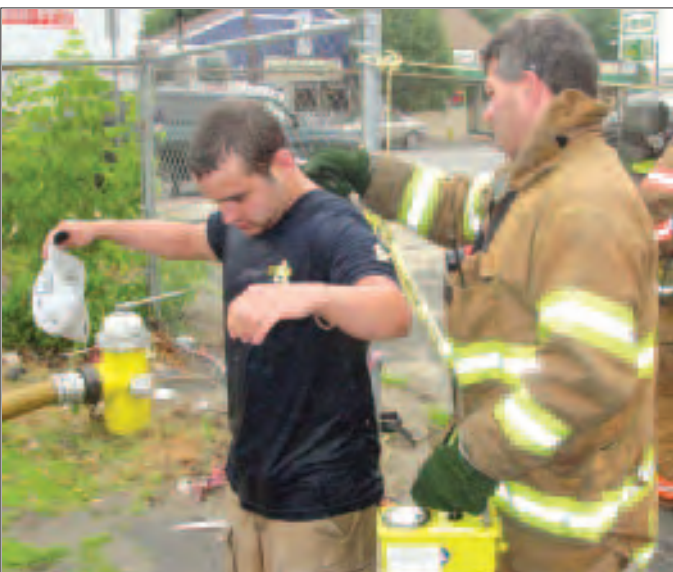
Un bombero mide la radiación de una de las víctimas antes de enviarlo a la ambulancia de Patriot que está esperando.

Firefighters from Lawrence and Methuen are ready to begin decontamination by spraying water over the victims.