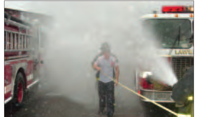
Un bombero guía a una de las víctimas a través de una cortina de agua para lavar su contaminación.

Three contaminated bystanders waiting to be treated.