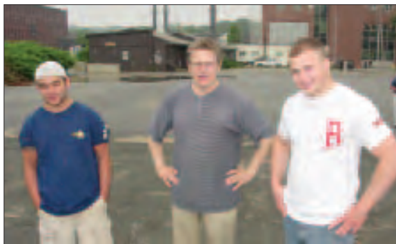
Tres peatones contaminados esperando a ser socorridos.

Lawrence Fire Department was the first to arrive.