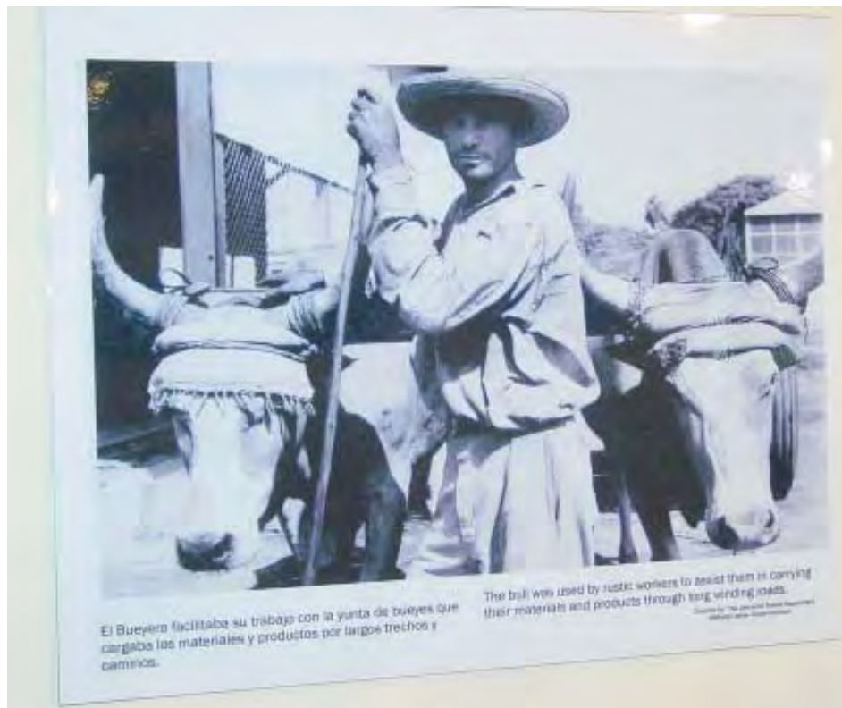
Una de las fotografías que pueden ir a ver al Heritage State Park.