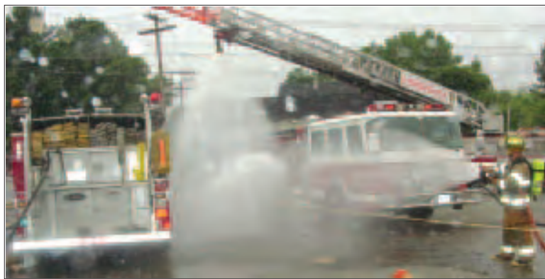
Bomberos de Lawrence y Methuen listos para dar la primera ducha a los contaminados con radiación.

Lawrence Firemen helping a wounded citizen.