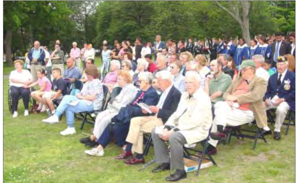
Vista parcial del público que asistió a la ceremonia de develación del monumento a William Lord en el Parque Campagnone.