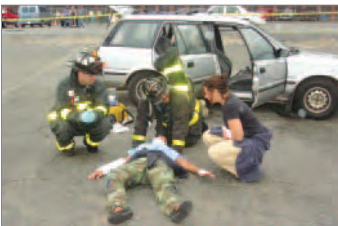
Bomberos de Lawrence confortando a un herido.

A fireman escorts one of the victims through a decontaminating shower.