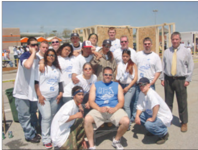
Team YouthBuild Lowell (MA)