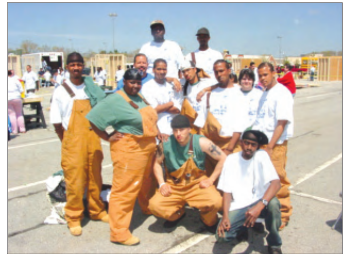
Team YouthBuild Hartford (CT)