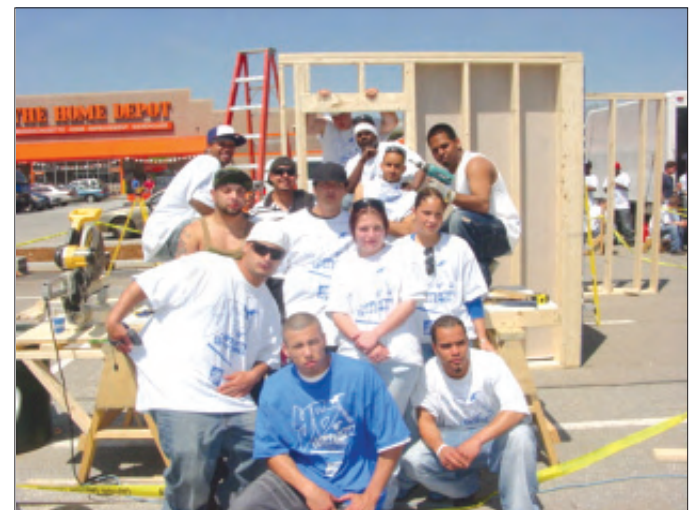
Team YouthBuild Lawrence (MA)

1997: Lawrence 1998: Lawrence 1999: Lawrence 2000: Springfield 2001: New Bedford 2002: Lawrence 2003: Springfield 2004: New Britain