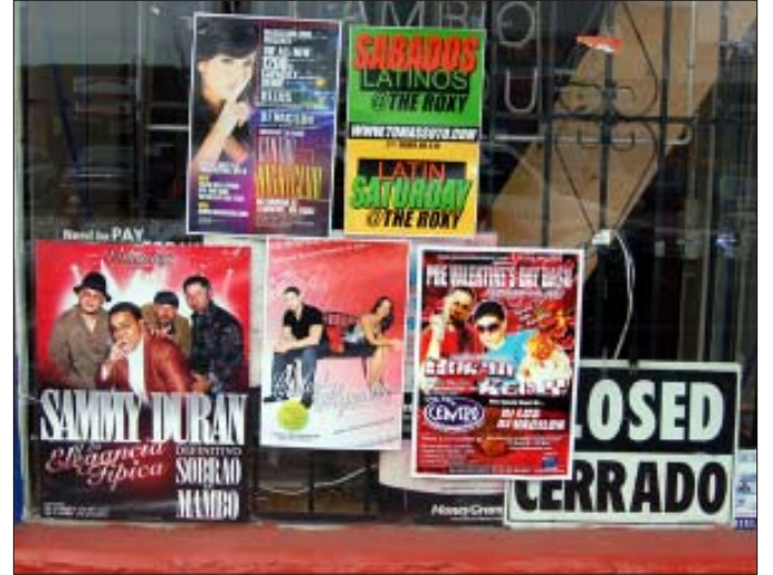
214 Broadway en un establecimiento cerrado.