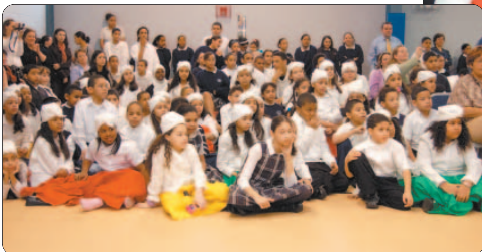
Un grupo de alumnos disfrutando de la función. A group of children enjoying the function.

Kids enjoyed the presence of one of the Three Kings.