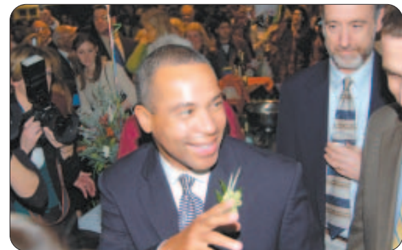
Deval Patrick saludando a todos sus amigos a su llegada al gimnasio.