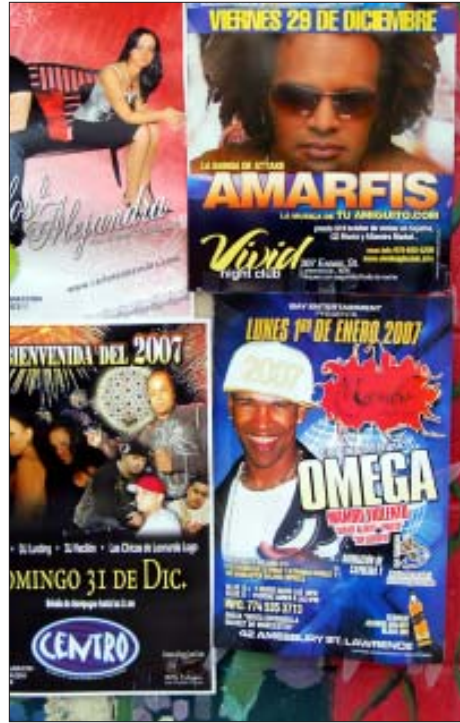
Corner of Bradford and Broadway