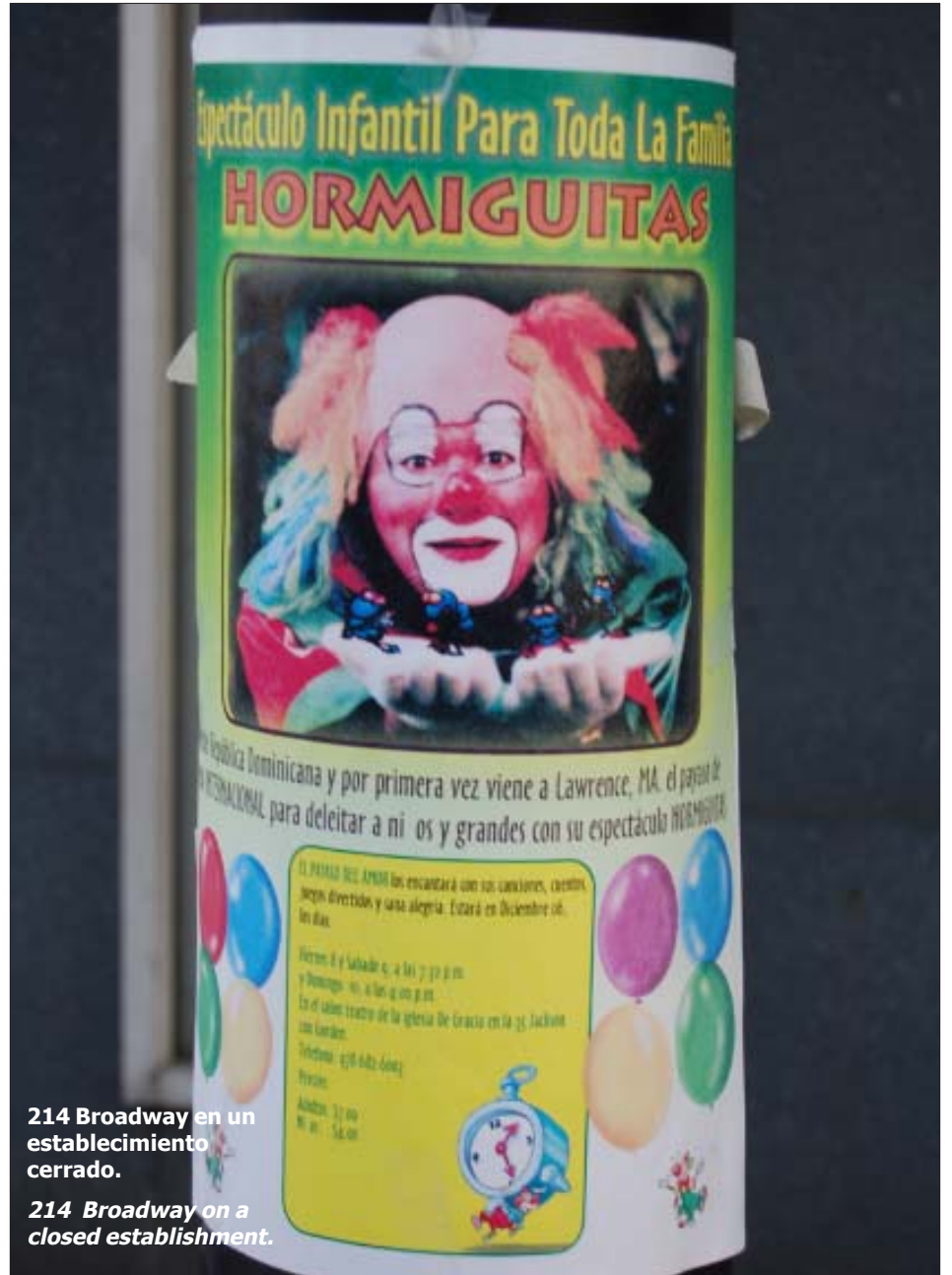
214 Broadway en un establecimiento cerrado.