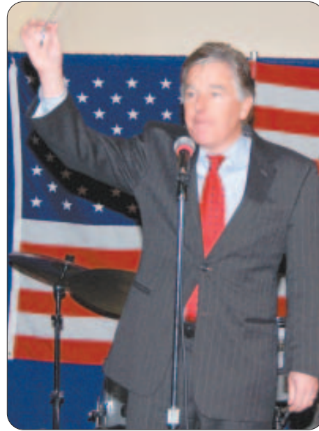
El Congresista Marty Meehan encontró una pulsera y estaba buscando a su dueña.