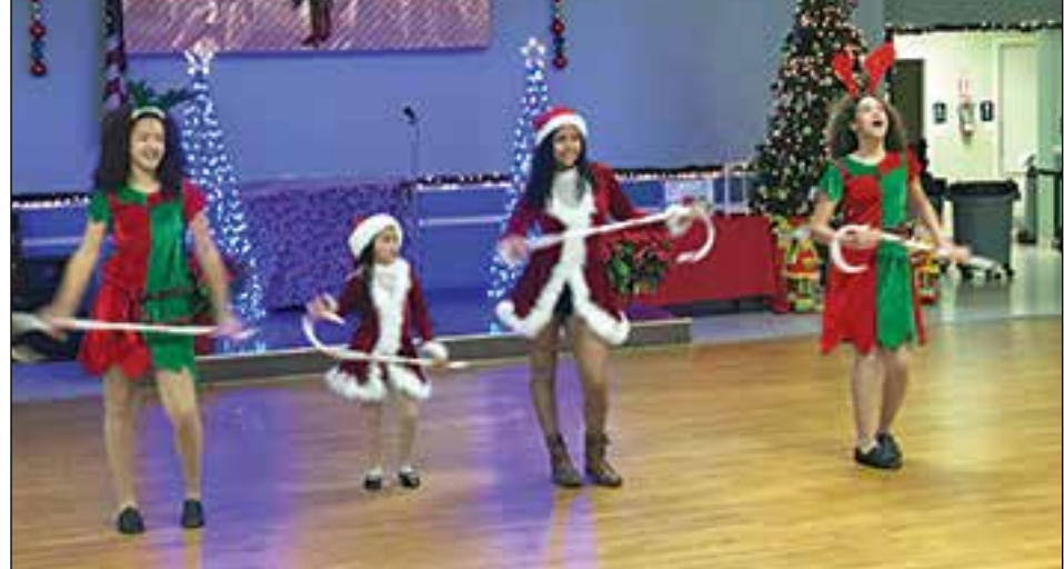
Bailes de las Batuteras Internacionales