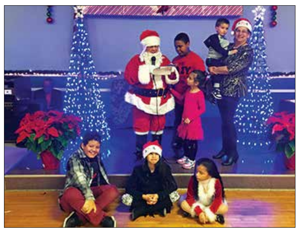
Santa Claus presente en el aguinaldo, alegró la noche a los niños.