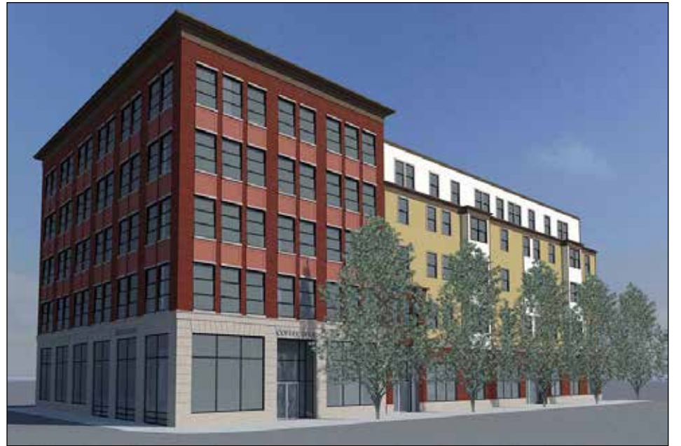
(Artist rendering of both buildings when finished)

Beacon Properties estará a cargo de la administración local del proyecto cuando se concluya.