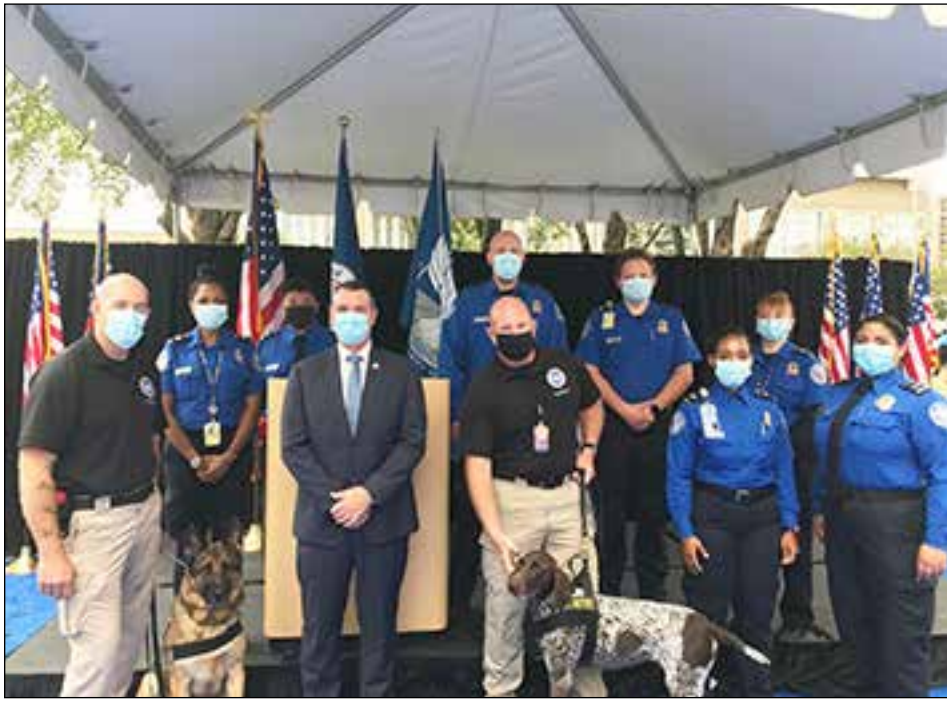
El administrador de la TSA, David Pekoske, con los oficiales de seguridad del transporte presentes en la ceremonia de la agencia para conmemorar el 19º aniversario de los ataques terroristas del 11 de septiembre de 2001.

TSA Administrator David Pekoske with Transportation Security Officers present at the agency's ceremony commemorating the 19th anniversary of the Sept. 11, 2001, terrorist attacks.