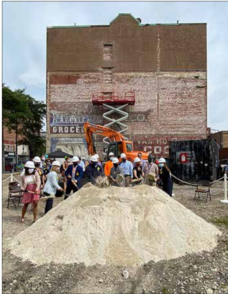
Ground was officially broken Wednesday, September 9, as Mayor Dan Rivera joined officials from GLCAC, Inc. to kick off construction of 39 units of affordable housing on Essex St. Pg. 5