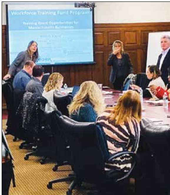
Middlesex Community College will host a virtual info session for businesses seeking WTF grants from 10 a.m. to 11:30 a.m. on Wednesday, September 30. Before COVID-19, students took a Workforce Training Fund info session in-person.