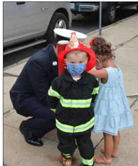
Futuro bombero siguiendo los pasos de su padre.

As part of the required precaution in the time of COVID-19, not too many people attended from the public as they usually do and those who were there, stayed behind keeping a safe distance.