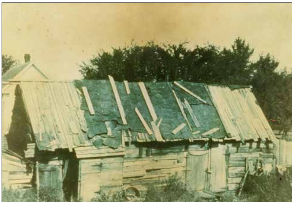
Esta choza es un ejemplo de dónde habrían vivido los inmigrantes irlandeses que llegaban a Lawrence.

Northern Essex Community College has campuses in both Haverhill and Lawrence. It offers approximately 60 associate degree and certificate programs as well as hundreds of noncredit courses designed for personal enrichment and career growth. Each year, 6,000 students are enrolled in credit associate degree and certificate programs on the Haverhill and Lawrence campuses; and another 2,000 take noncredit workforce development and community education classes on businesses and community sites across the Merrimack Valley. For more information, visit the website at www.necc.mass.edu or call 978-556-3700.