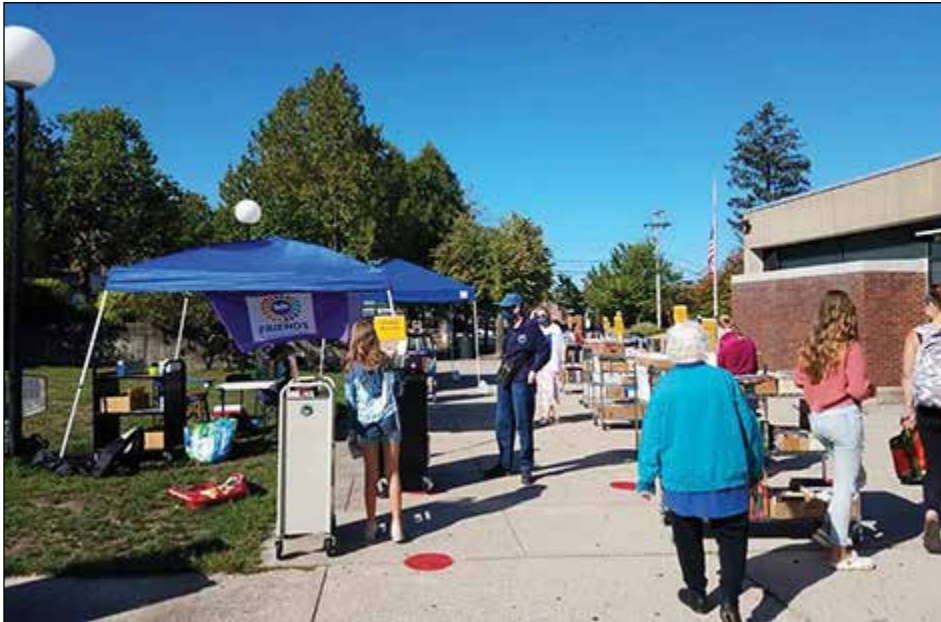
Customers browsed the Friends of the Nashua Public Library

The Friends of the Nashua Public Library will hold their last Pop-Up Book Sale of 2020 on Saturday, October 3, on the Library Plaza from 10 a.m. to 2 p.m. The rain date is Saturday, October 10.