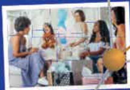
INFECTADO EN BABY SHOWER DE UN AMIGO