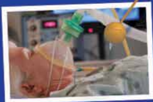
VISITA A LA ABUELA