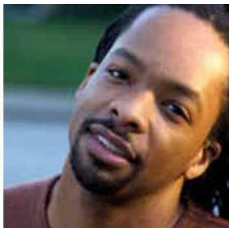
Pulitzer Prize-winning poet Jericho Brown will be a special guest at "The Black Matter Is Life" on January 21.