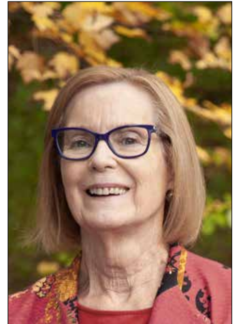
The Incompass Human Services team at their Chelmsford location, Incompass received a GLCF COVID-19 Emergency Response Fund grant to fund PPE for COVID-facing direct support and nursing staff.