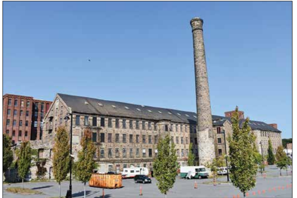
WinnDevelopment transformará The Stone Mill, de 176 años de antigüedad, en Lawrence, Massachusetts, en viviendas de ingresos mixtos.

El proyecto será el tercer desarrollo de reutilización adaptativa de WinnDevelopment para revivir un molino histórico en Lawrence, luego de la transformación exitosa de dos antiguos edificios de Malden Mills para crear el galardonado complejo LoftFive50, que cuenta con 137 unidades de viviendas asequibles.