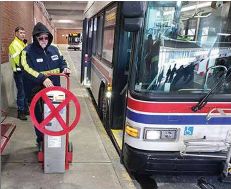
A worker removes the last fare box from a Merrimack Valley Regional Transit Authority bus.

Como informó WHAV en diciembre, los miembros de la junta de la Autoridad de Tránsito votaron unánimemente a favor de un programa piloto de dos años de autobuses gratuitos en todas las rutas fijas locales y servicios de paratransito EZ Trans. Las tarifas aún se cobrarán en el autobús Boston Commuter. Las tarifas perdidas se están reemplazando con dinero federal de la Ley de Ayuda, Asistenciay Seguridad Económica de Coronavirus y la Ley del Plan de Rescate Estadounidense.