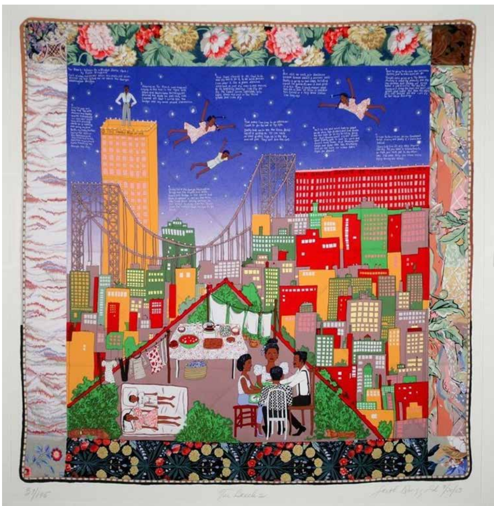
Faith Ringgold's Tar Beach encourages children to soar high and follow their dreams.

Monday 9:00AM-12:00PM Tuesday 9:00AM-6:00PM Wednesday 9:00AM-4:00PM Thursday 9:00AM-4:00PM Friday 9:00AM-3:00PM Saturday 1:30-4:00PM