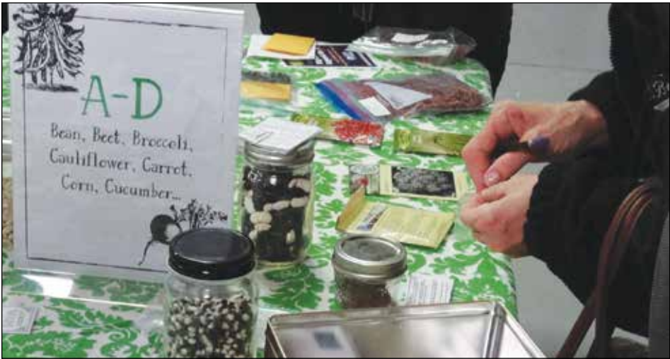
Multiple varieties of seeds were available at an earlier Nashua Public Library seed swap. This year's event will take place from February 28 to March 6.

The Nashua Public Library will hold a seed swap in the Chandler Memorial Wing from Monday, February 28, until Sunday, March 6.