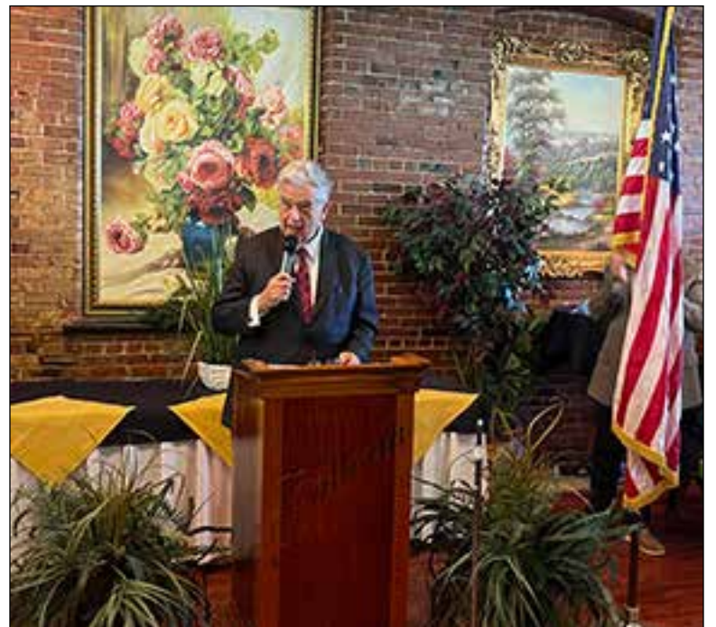
Haverhill Mayor James J. Fiorentini's breakfast on February 11th turned to a big announcement. Pg. 6