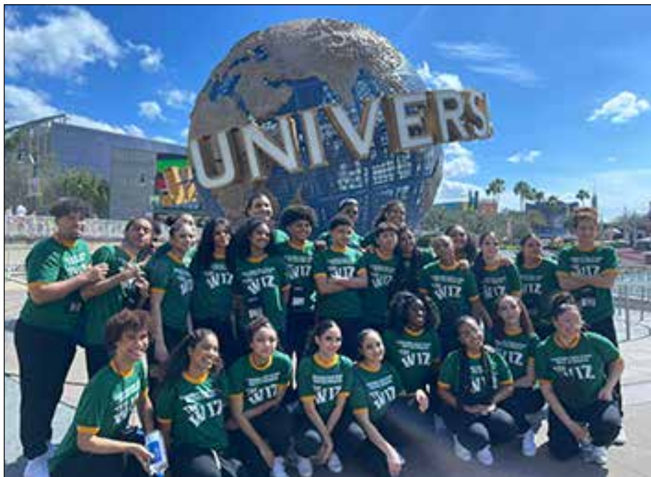
Read about their triumph on page 8 in Spanish and on page 9 in English.