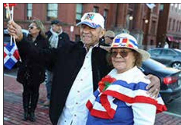
Seguido del izamiento de la bandera tuvieron una celebración en el Ayuntamiento con bailes y más diversión.