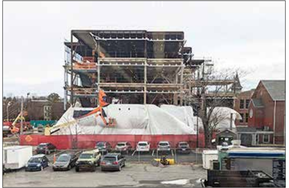
Esta es una vista de la construcción detrás de la Escuela Oliver, desde la Biblioteca de Lawrence.