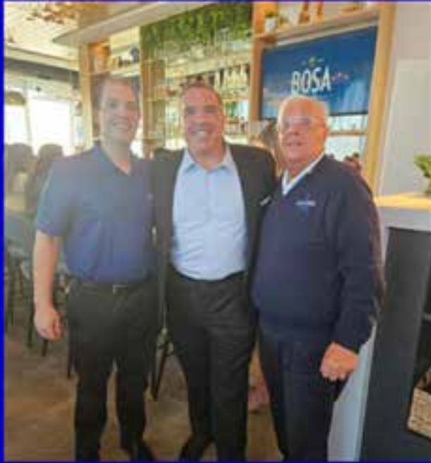
North of Boston Convention & Visitors Bureau Marketing Ceremony!