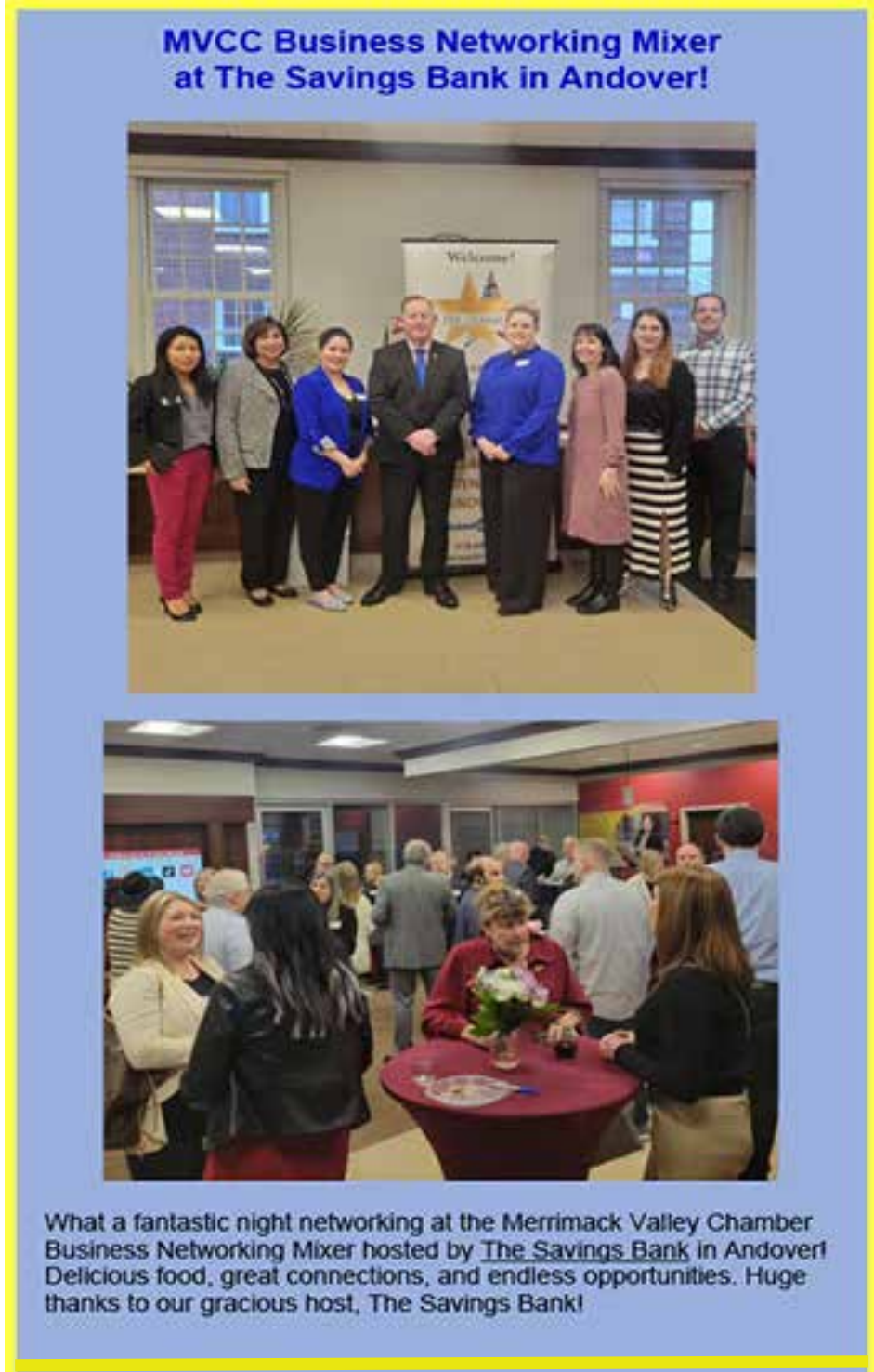
MVCC Business Networking Mixer at The Savings Bank in Andover!

What a fantastic night networking at the Merrimack Valley Chamber Business Networking Mixer hosted by The Savings Bank in Andover! Delicious food, great connections, and endless opportunities. Huge thanks to our gracious host, The Savings Bank!