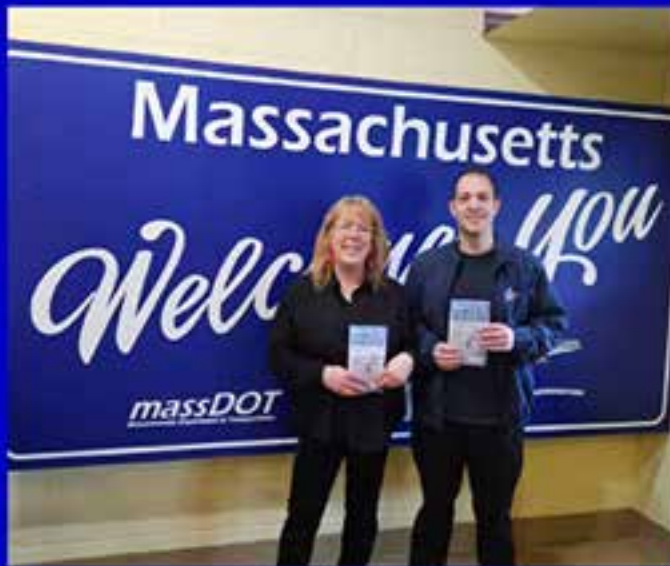
Merrimack Valley Chamber Means Business Member Interview and Speaker Series!