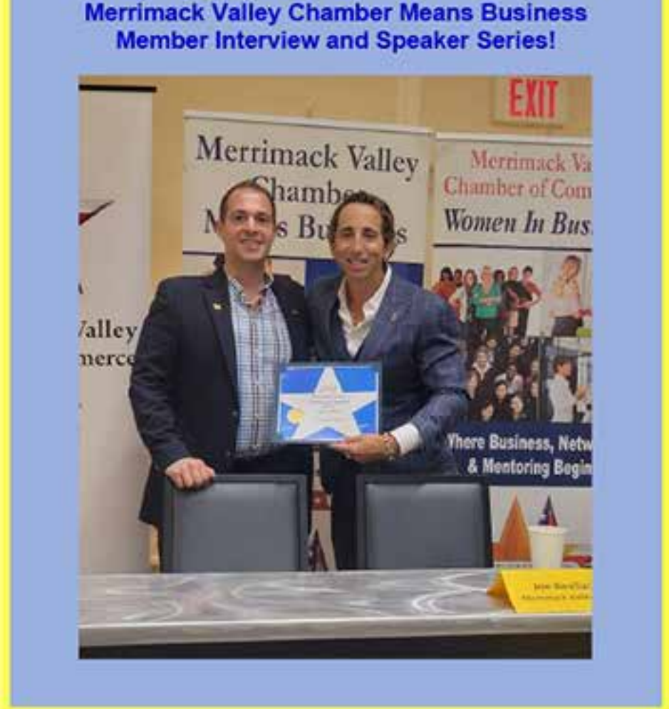
Merrimack Valley Chamber Means Business Member Interview and Speaker Series!