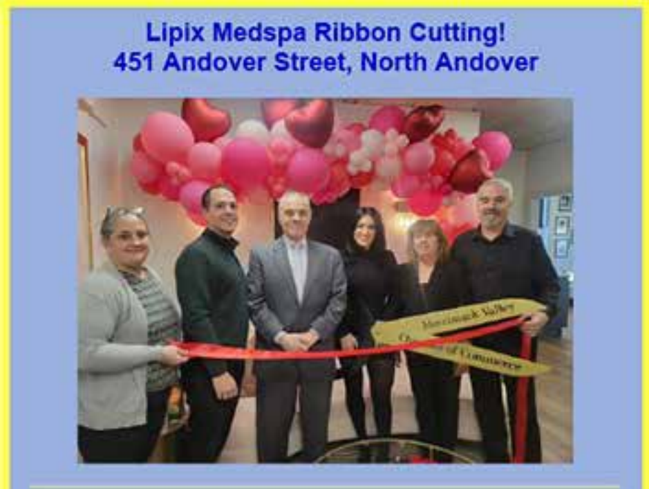
Lipix Medspa Ribbon Cutting! 451 Andover Street, North Andover

The Merrimack Valley Chamber hosted a Women in Business Networking Reception at Renaissance Golf Club in Haverhill on April 23rd. Nearly 50 attendees had the opportunity to network and make new business connections with other Women in Business throughout the Merrimack Valley.