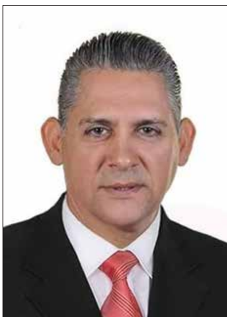
Por Tomás Núñez, ThD

La ecología se ha transformado en el contexto general de todos los problemas, proyectos oficiales y privados. A ella está ligado el futuro de nuestro planeta y de nuestra civilización de donde se deriva su importancia ineludible. O cambiamos de manera de habitar la Casa Común o podemos conocer situaciones ecológicas y sociales dramáticas, dentro de no mucho tiempo. Aquí van fragmentos de un discurso ecológico, parte de un Todo más grande y vasto.