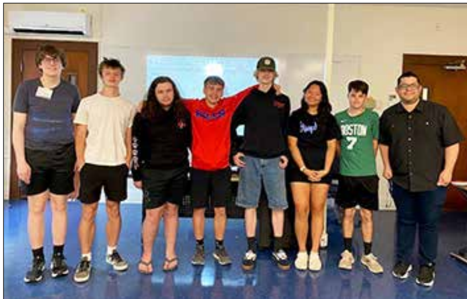
During the summer, Middlesex Community College offered an Engineering/Computer Aided Design (CAD) course through their College for Teens program. Students explored the engineering field and gained experience in a potential future academic or career interest.