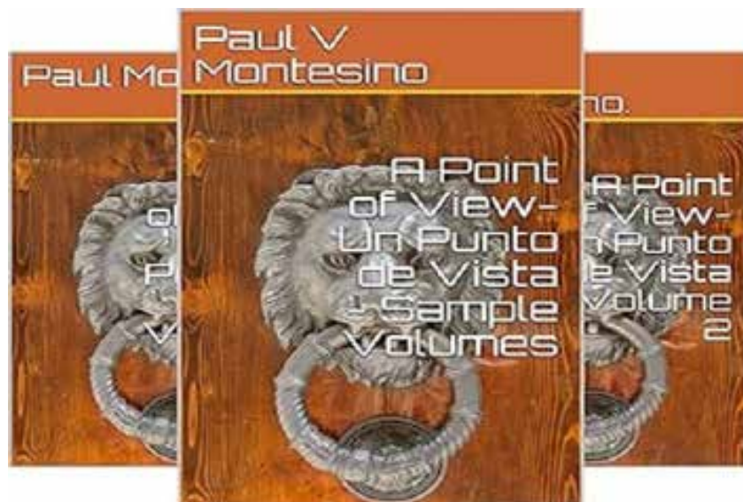
A Point of View-Un Punto de Vista: Volume Seven-Volumen Siete. (A Point of View-Un Punto de Vista Bilingual books) (Spanish Edition) Spanish Edition | Related to: A Point of View-Un Punto de Vista Bilingual books | by Dr. Paul Victor Montesino.