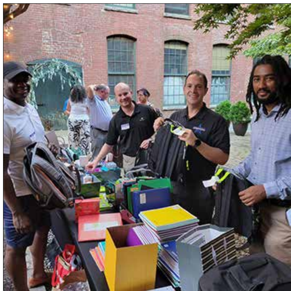
Some of the volunteers filling the backpacks for the YMCA’s children.