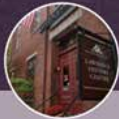
10:00 AM - 10:45 AM Annual Business Meeting & Updates