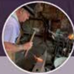
9:30 AM - 1:30 PM Blacksmithing at the Essex Company Forge

10:00 AM--10:45 AM Annual Business Meeting & Updates [Business Meeting Materials will be posted soon]