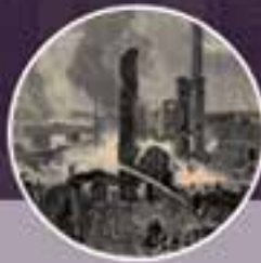
11:00 AM - 12:00 PM White Fund Lecture "No Avenging Gibbett": The 1860 Pemberton Mill Collapse"