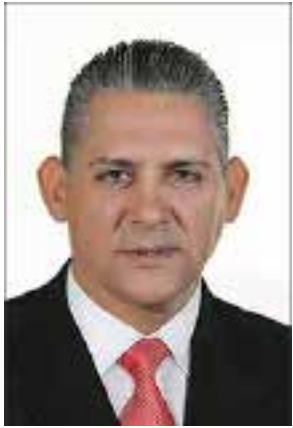
Por Tomás Núñez, ThD.

Uno no puede decir que el universo aparece por azar, de la nada no sale nada.