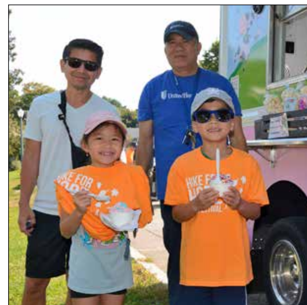
Food Trucks and Happy Faces