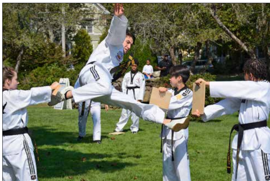
A Tae Kwon Do Demonstration

Gracias una vez más por ser parte de este día significativo. Con amor, esperanza y servicio, juntos, estamos haciendo una diferencia.