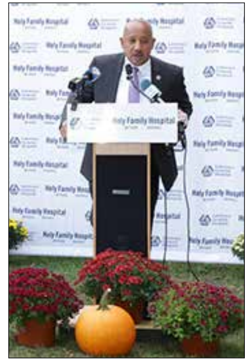
Brian A. DePeña, Mayor of the City of Lawrence.

Debemos atrevernos a ser grandes, y debemos darnos cuenta de que la grandeza es el fruto del trabajo, el sacrificio y el gran coraje.” “We must dare to be great; and we must realize that greatness is the fruit of toil and sacrifice and high courage.” - Theodore Roosevelt