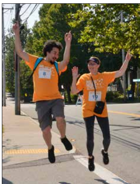
Hikers Jump for Joy

Para conocer más formas de apoyar a Lazarus House Ministries, visite nuestra página de donaciones: https://p2p.onecause.com/hikeforhopefallfestival . ¡Gracias!