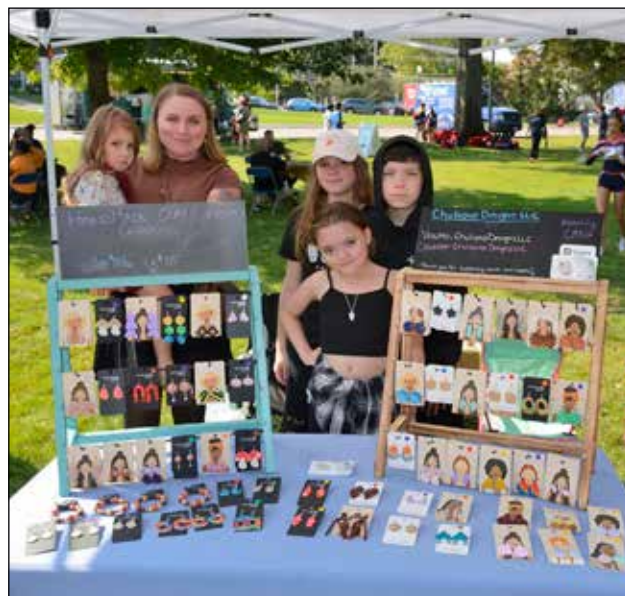
Chulapop Designs Llc Vendor Tent