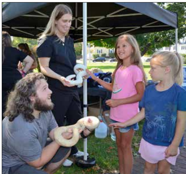
Andover Animal Hospital and friends