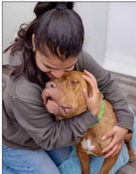
(Bull Terrier)