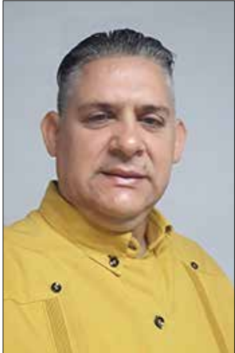
Por Dr. Tomás Núñez

La higiene mental es el conjunto de actividades que permiten que una persona esté en equilibrio con su entorno sociocultural. Estas acciones intentan prevenir el surgimiento de comportamientos que no se adapten al funcionamiento social y garantizar el ajuste psicológico imprescindible para que el sujeto goce de buena salud mental.