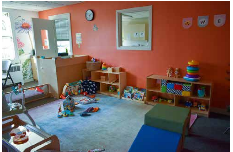
The infant room at the Merrimack Valley YMCA’s new South Church Child Care Center