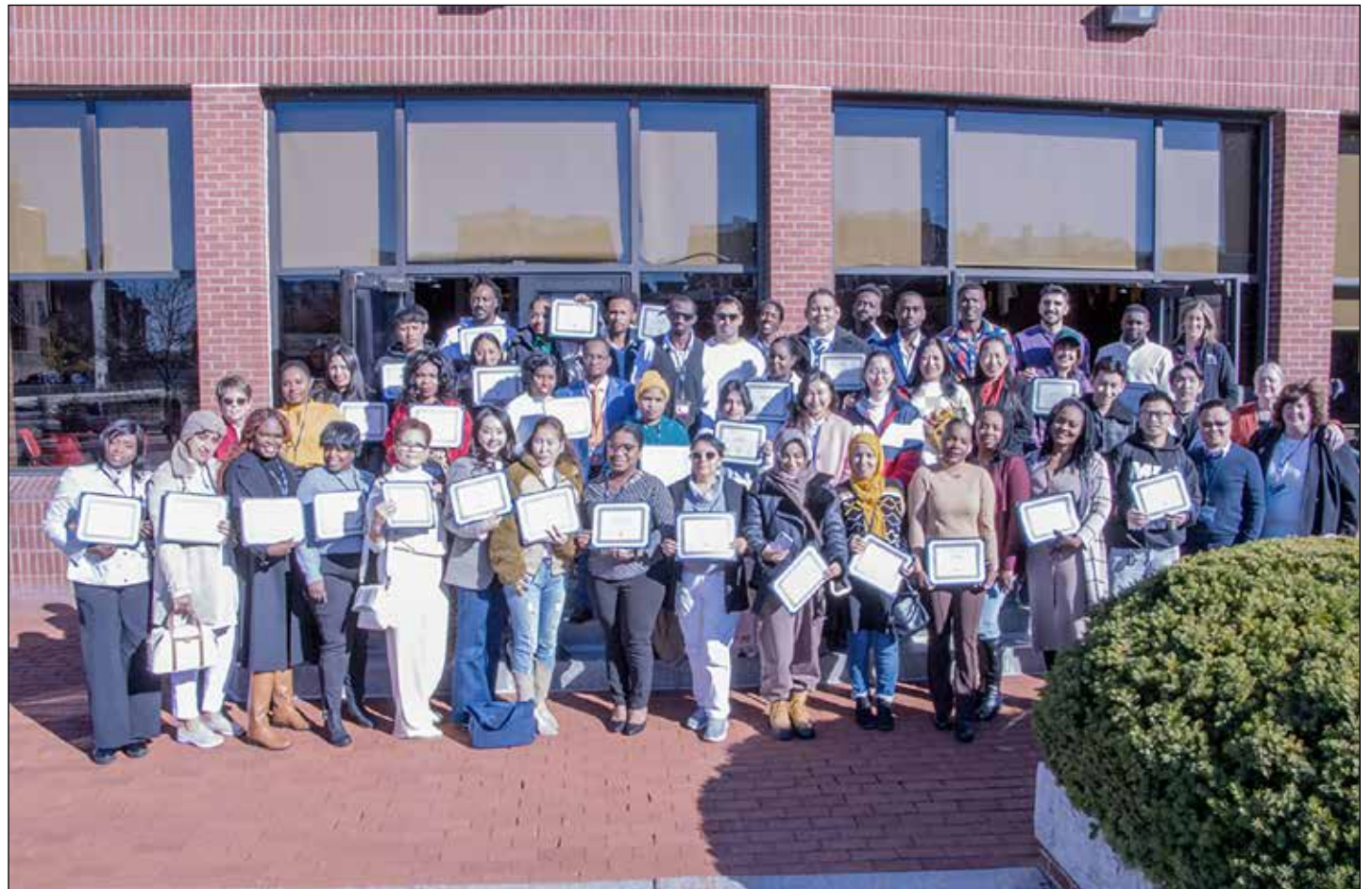
MCC's Prepare to Attend College Honors Student Achievement